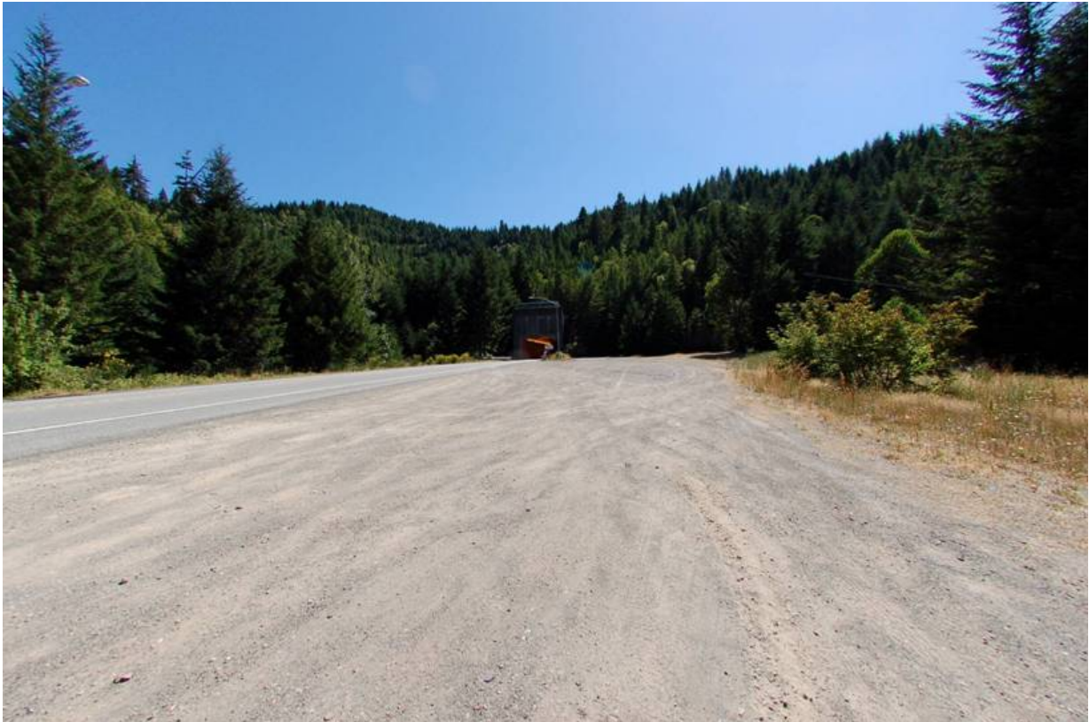
Figure 2: Collier's Tunnel

A single site and the challenge of deploying a field element at that site provided the origin of this project, with the scope subsequently defined to cover the entire District, with potential statewide application. Caltrans wanted to deploy a camera at Collier's Tunnel (Figure 2) on US 199 near the Oregon border. In the absence of other options, GPRS Ethernet modems were tried and didn't work, even with high-gain Yagi antennas. Other options such as landline telephone service were not available. Environmental issues, particularly a tree fungus, prohibited microwave towers from being installed in this area for fear of spreading the fungus. Thus, there were few options to provide communications capability at this site.