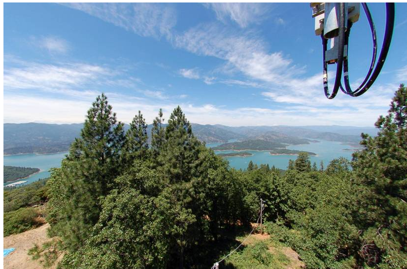
Figure 5: View to North from District 2 Backbone Site