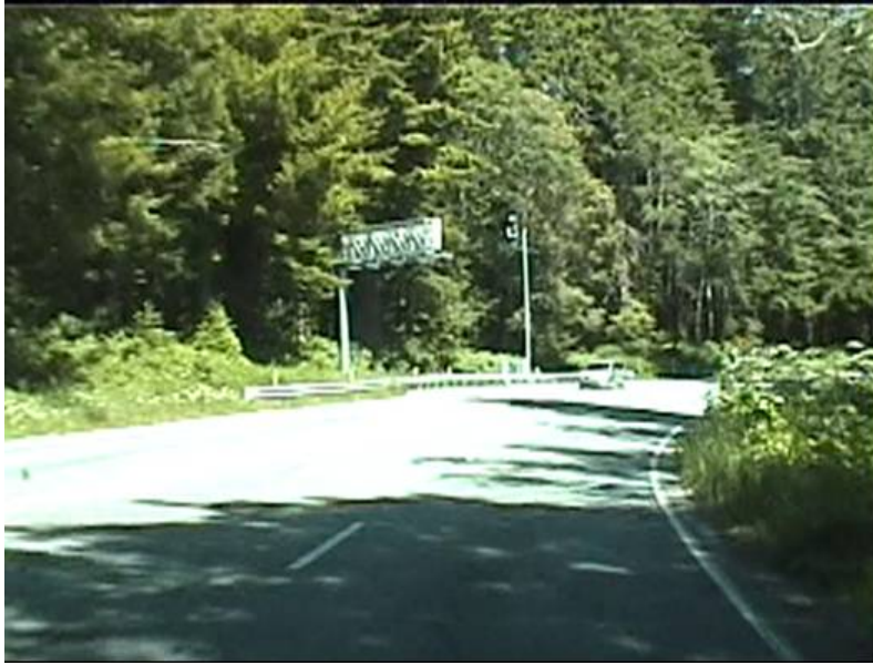
Figure 1: Redwood Forest near CMS along US 101 in Caltrans District 1