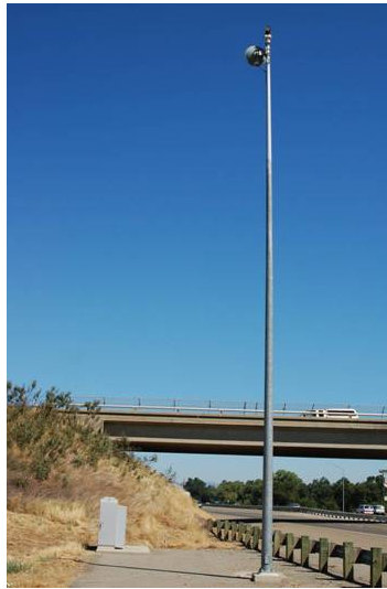
Figure 3: District 2 ITS Node South of Redding

As important as the hybrid nature of the network and the migration plan was the network topology. District 2 developed the concept of “ITS Nodes” (See Figure 3) in 2002 as aggregation points that connect field elements in proximity to provide a “gateway” to the microwave backbone (See Figure 4 and Figure 5) or to telco-provided backhaul infrastructure. The concept of “Roadside LANs” was used to describe the local area field element network. These concepts are fundamentally consistent with IP-based networks in general. Since District 1 was already using an IP-based network, it was apparent that similar techniques were applicable in District 1.