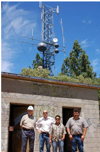
Figure 4: A District 2 Backbone Site North of Redding