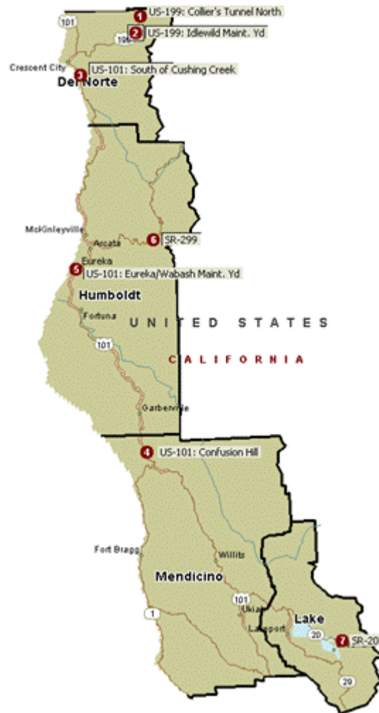
Figure 6: Seven "Representative Sites" in District 1, Map Created Using Microsoft MapPoint™

“Hypothetical” sites are sites that currently don’t exist as TMS. In the case of Collier’s Tunnel, there was a desire to create at TMS at the location. Other sites were chosen from existing sites having known, but perhaps limited, communication capabilities, along with sites at apparently challenging locations such as Idlewild Maintenance Yard and on SR 299 near the District 1 / District 2 boundary. Subsequently, the Eureka Wabash Maintenance Yard site was eliminated from the evaluation list because it is currently well served by a 1,544 MB/s T1 line. In retrospect, it would have been desirable to include an alternate “urban” example and perhaps an example in which the ocean might cause multi-path interference for the sake of completeness.