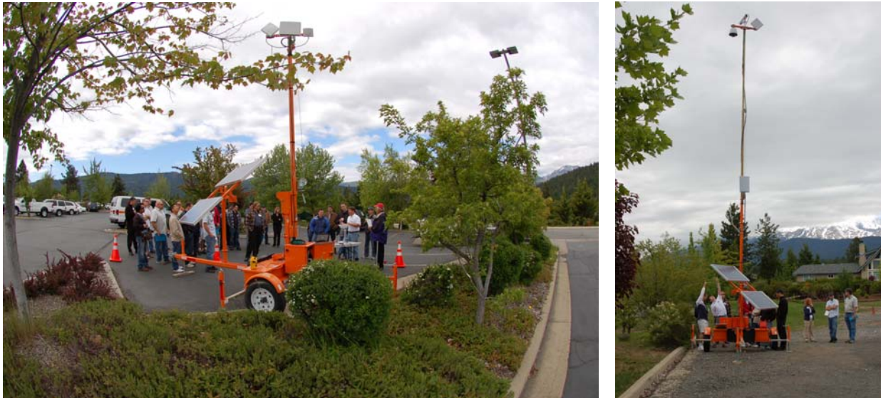
Figure 9: Demonstration at WSRTTIF, June 2008

While it was not used as such, the mobile demonstration system would be very suitable to pre-deployment field testing that should be conducted before deploying a system.