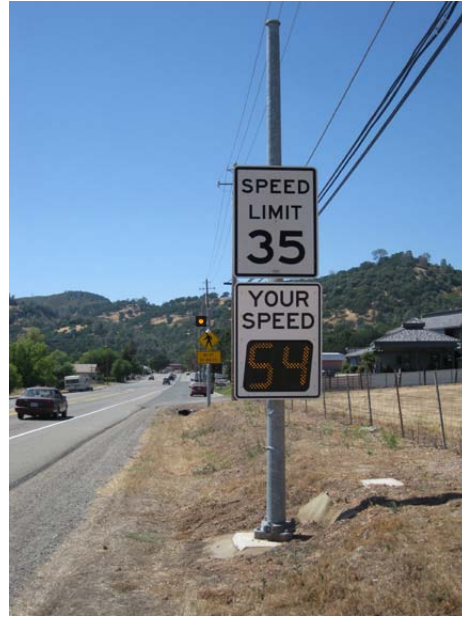
Figure 2: Permanent Speed Sign Example