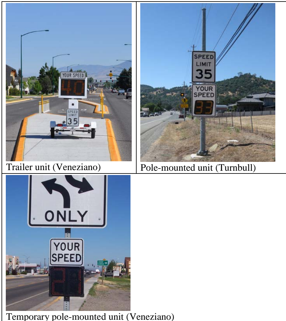
Trailer unit (Veneziano)

Radar speed signs 1 have seen increased application in recent years in communities across the United States. These devices, which measure (by radar) and display the speed of vehicles passing by, are typically mobile (trailer-based) units or are permanent pole/post-mounted digital display boards. Smaller portable pole/post-mounted displays intended for brief deployments have also recently become available. An example of each type of these units is presented in Figure 1-1. Such devices are used to reduce traffic speeds by making drivers aware of how fast they are moving relative to the speed limit and inducing them to adjust their speed accordingly.