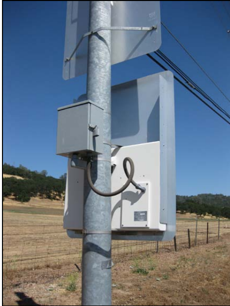
Figure 3: Example of Grid Charged Sign Installation