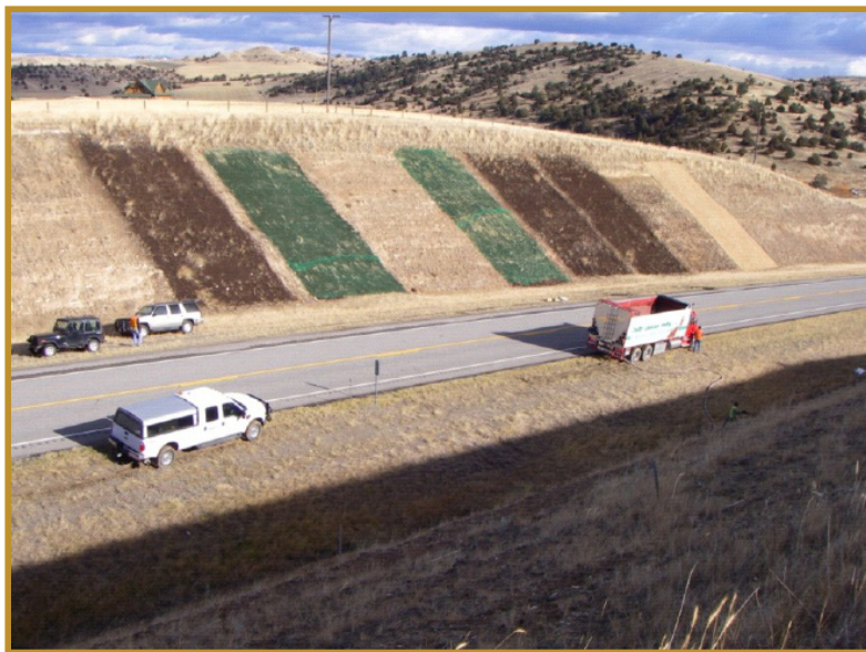
Figure 2: View of eight south-facing plots that are across highway from the four north-facing plots (western plots). Plot 11 is shown furthest to the left in the image while plot 18 is most distant (to the right or east).

pieces were smaller than 1 cm (3/8 in). A chemical analysis of the compost indicated high total levels of N, P and potassium (K), macronutrients that generally support plant response when applied to nutrient-poor soils like those found at the research site. Three depths of compost were selected to be placed on seeded plots on both south-facing and north-facing cut slopes: 0.32 cm (1/8 in), 0.64 cm (1/4 in) and 1.27 cm (1/2 in). The five compost retention methods were employed only on the environmentally harsher south-facing slopes, with a compost depth of 1.27 cm. The five retention measures were coconut-straw fiber erosion control blanket, lightweight plastic netting and three commercially available tackifiers (Figure 2). The three tackifiers were 1) polymer emulsion liquid, 2) guar-based water dispersible formulation and 3) Plantago -based seed husk powder. These treatments were compared to seeded control plots.