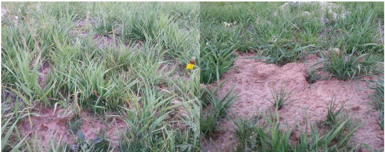
Figure 10: Seedlings are able to penetrate the 68 g/m 2 and 136 g/m 2 carded wool batting (left), but had difficulty penetrating the 203 g/m 2 and 271 g/m 2 carded wool batting (right).