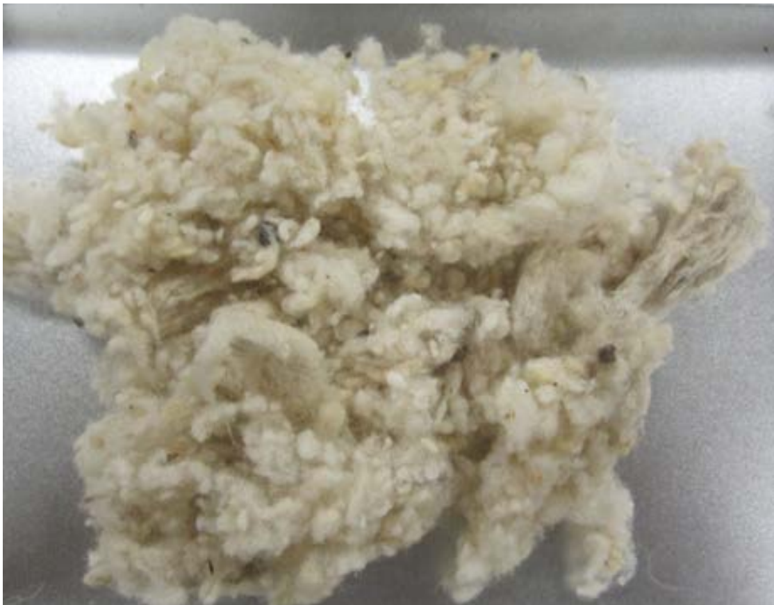
Figure 6: Washed and scoured wool sample from Brookside Woolen Mill.

Washed and scoured wool of 7.6 - 17.8 cm (3 - 7 in) fibers, or cut into shorter fibers, is available at the Brookside Woolen Mill (Figure 6). The color of the wool fibers or the contamination with hair is not important. The long wool fibers have the potential to be mixed with straw to make ECB. It could possibly be a substitute for imported coconut fibers while adding the water holding and nutrient benefits of wool. The loose pieces sell at a relatively low cost and could be added to ECB in a variety of straw/wool ratios. The washed and scoured wool pieces can also be shredded which may be beneficial for incorporation into an ECB (Figure 7).