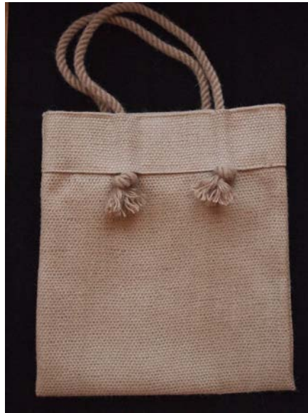
Figure 2: Wool bag made from woven T wool.

attributes. T wool ® is available in 100 m (328 ft) and 35 m (115 ft) spools, and in woven bags (Figure 2). T wool ® is currently used as a garden product that is compostable, turning into a slow-release fertilizer as it degrades (T wool 2012).