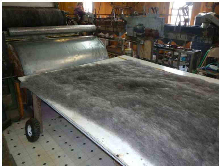
Figure 5: Wool batting produced at Sugar Loaf Wool Carding Mill in Hall, Montana.

Two Montana wool mills, Sugar Loaf and 13 Mile make wool batts. The batts produced are approximately up to 1.2 meters wide and 0.9 meters long (4 ft x 3 ft). Both companies can produce the batts in a variety of weights and colors (Figure 5). The wool batting has a potential for roadside reclamation use as an ECB when used in conjunction with a natural (i.e., cotton) open mesh retention layer.