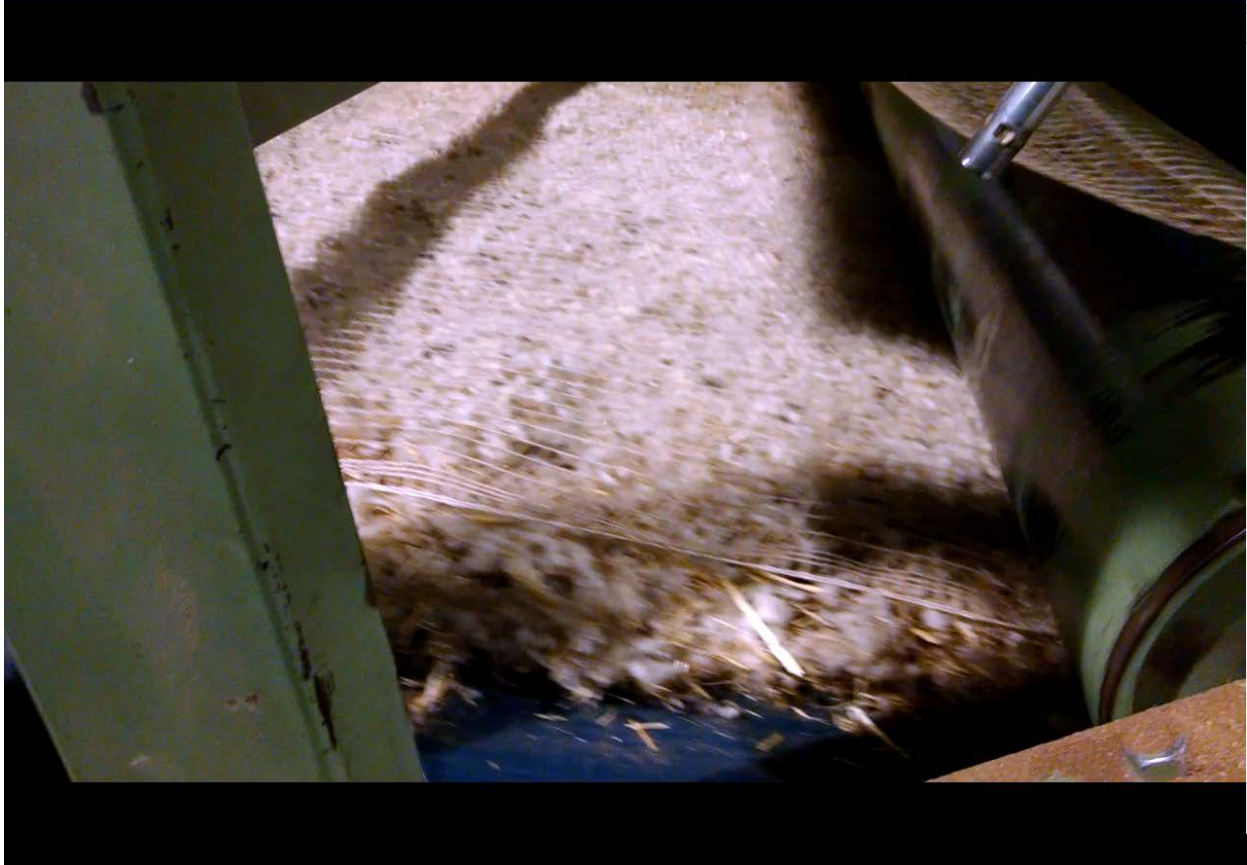
Figure 12: Screen capture of a video of Ramy experimenting with a wool-straw combination for fill in the roller to produce short-term ECB blankets.

The results of the experimentation were rolls of ECB of different wool and straw ratios. These rolls were sent to the WTI research team for their review. The research team and a representative of MDT found the products to be very similar in appearance and function to standard short-term ECB rolls. It was observed that there were a variety of mixes of wool and straw as fill, but it was the two external mesh layers that give the material its strength. Thus, pure wool and wool:straw of different ratios that filled the experimental ECBs could be installed and secured on roadside slopes exactly the same as standard rolled short-term straw fill ECB materials.