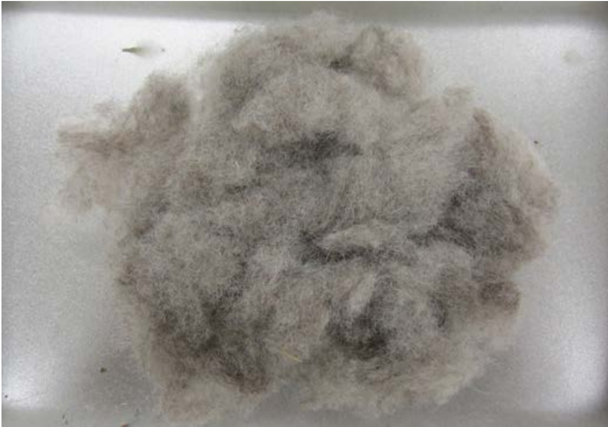
Figure 7: Washed, scoured and shredded wool sample from Brookside Woolen Mill.