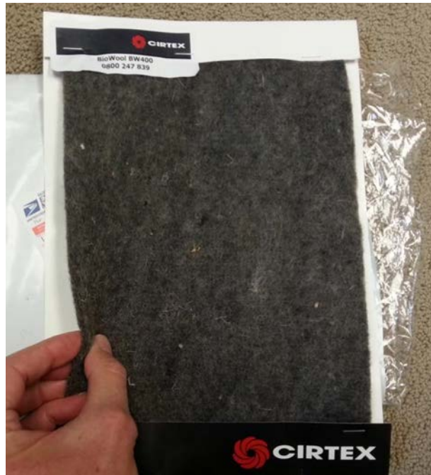
Figure 1: Biowool, BW 400, product sample from Cirtex Industries in New Zealand.

1). In addition, BioWool assists vegetation establishment while insulating the seed and root zones from extremes of heat and cold through moisture penetration. The BioWool 400 fabric also suppresses weeds while allowing establishment of plants, therefore reducing the need for chemical sprays (Cirtex 2014). Being a natural, recycled product also provides aesthetic advantages over synthetic products. BioWool 400 is available in 2 meter (m) x 50 m (6.6 feet (ft) x 164 ft) rolls.