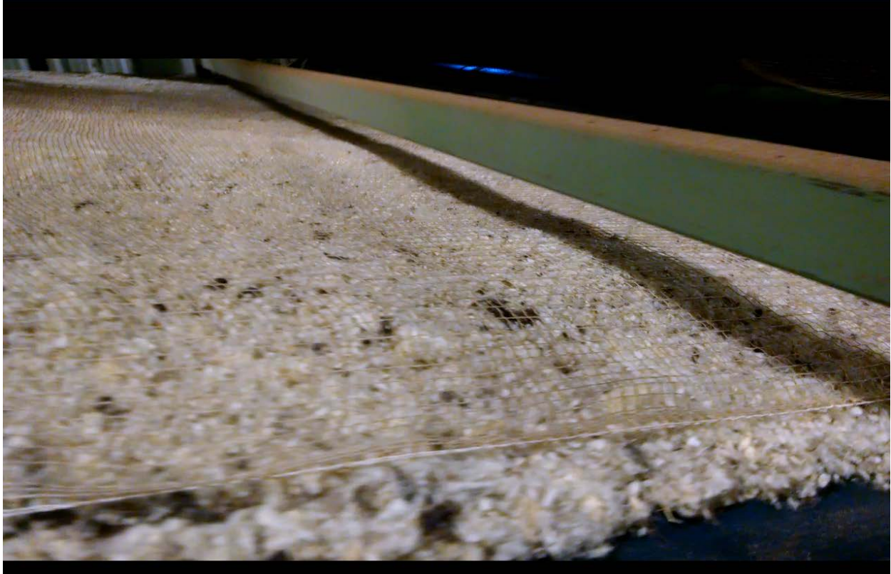
Figure 11: Screen capture from a video of Ramy experimenting with pure wool fill in the ECB roller to produce short-term ECB blankets for this research project.

Ramy discovered that its machinery readily accepted wool in its hoppers and that they could mix straw and wool at different ratios (Figure 12), particularly if they had Brookside's cut and shredded wool product. They conducted a process of trial and error to become familiar with how the wool behaved in the roller machinery and how to get it into a mixture with the straw. A Ramy business partner stated that it only took one hour to convert the ECB roller operation from its standard manufacturing function to one that could use wool.