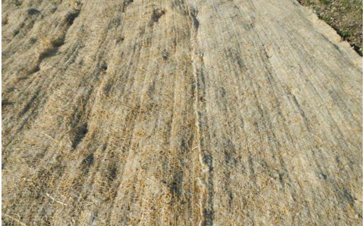
Figure 8: Photo of demonstration site where two different wool:straw ratio erosion control blankets produced by Ramy Turf Products are staked next to each other on a slope being reclaimed after recent construction along Interstate Highway 90 near Belgrade, Montana.