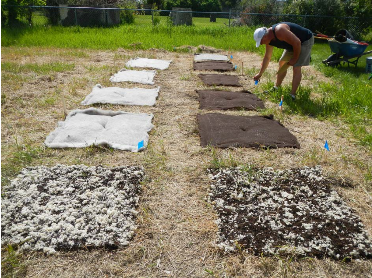
Figure 9: Field trial set-up to identify the products for large-scale testing.