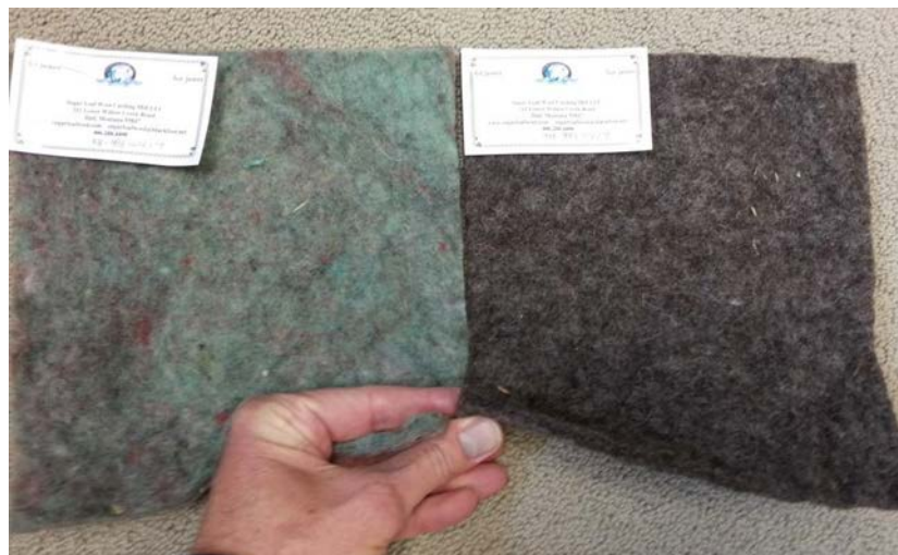
Figure 4: Wet felted wool samples from Sugar Loaf Wool Carding Mill.

Sugar Loaf produces wet felted wool mats. These mats are the same weight approximately 400 g/m 2 (12 oz/yd 2 ) as roadside reclamation materials produced in New Zealand (Figure 4). Sugar Loaf offers the options of producing the wet felted mats in a variety of weights in a three foot width. Sugar Loaf wet felted wool has the potential for making the following roadside reclamation products: ECB, weed mat, or silt fence.