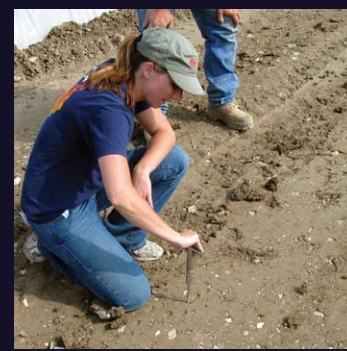
BROCHURE DESIGN BY MSU PUBLICATION & GRAPHICS