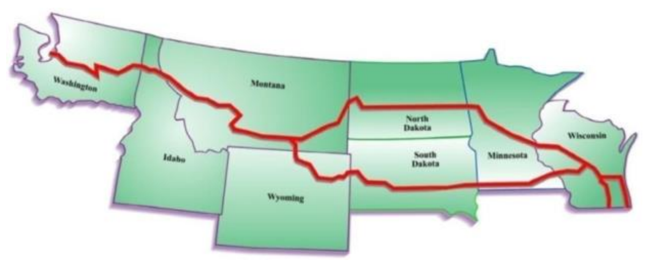
Figure 1: North/West Passage Corridor

The North/West Passage corridor follows I-90 and I-94 from Washington to Wisconsin through eight states and nearly 2000 miles. These two interstate highways comprise a major east-west corridor for commercial and recreational travel passing through Washington, Idaho, Montana, Wyoming, North Dakota, South Dakota, Minnesota and Wisconsin. This project will develop a traveler information platform to assist planning of long-distance trips, collecting and housing operational data, understanding messaging to modify driver behavior, and investigating how operational data might be used by the private sector to create a more sustainable business model. The emphasis of the OTIIS Project is to provide traveler information at the corridor-wide scale. Figure 1 shows the North/West Passage Corridor.