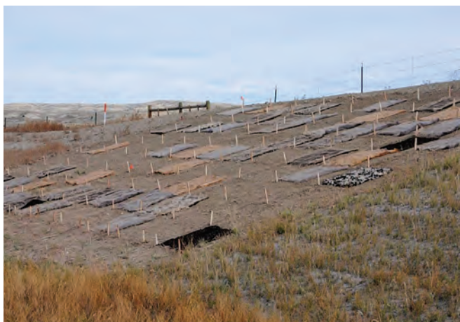
Experimental plots using a random block design along U.S. Highway 287 near Three Forks, Mont.

The goal of the field study was to conduct a side-by-side comparison of the performance of the wool products with the