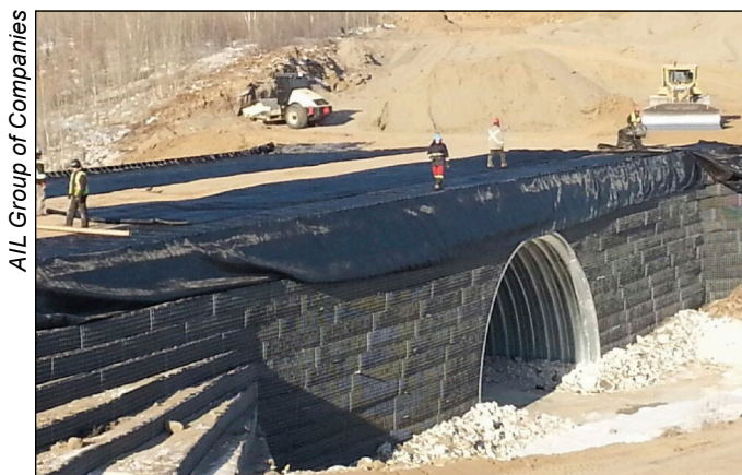
Figure 12—Geosynthetic reinforced soil is used for a buried bridge during construction.

New materials, technologies, products, and methods developed for other applications should be routinely assessed to determine whether they apply or can be adapted to wildlife crossing structures. Two promising options for wildlife overpasses include geosynthetic reinforced soil buried bridges (fig. 12) and high-density expanded polystyrene geofoam blocks (fig. 13). Other new and emerging materials include ultra-high-performance fiber-reinforced concrete, resins, and laminates.