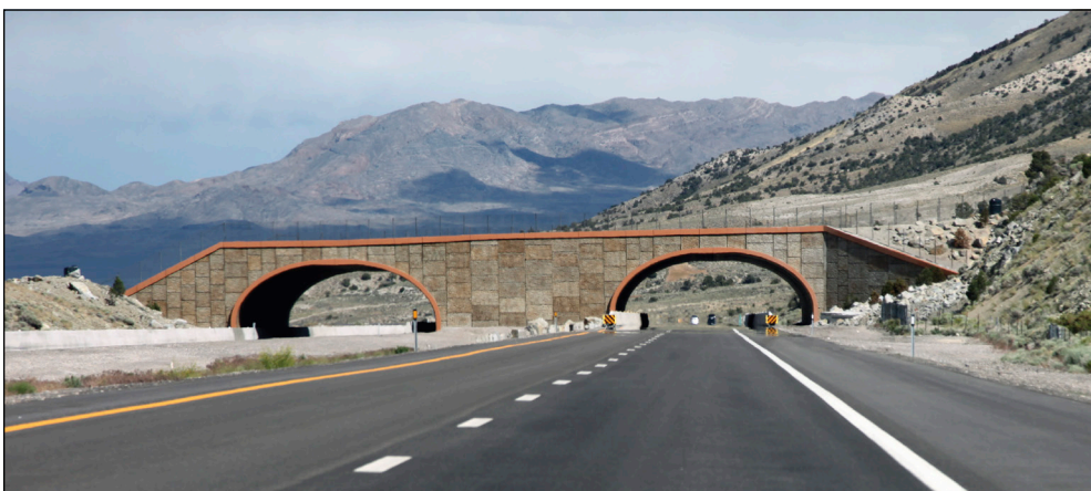
Nevada Department of Transportation

Using bevels as end treatments can be beneficial to project costs and design if geological, soil, meteorological, and other considerations permit. Buried bridges employ several end treatment options, some of which cost more than others. In North America, many existing crossings have a retaining headwall treatment, while in other parts of the world, bevel end treatments, which incorporate the natural angle of repose for the fill material, are common (see examples displayed in figs. 10 and 11). For example, a budgetary assessment suggests that if the Banff National Park wildlife overpass structure had used a bevel end treatment, a $400,000 cost reduction might have been attained, all other factors excluded (Williams 2014).