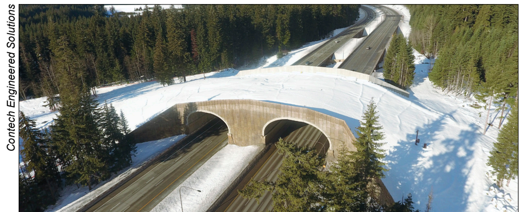
Contech Engineered Solutions