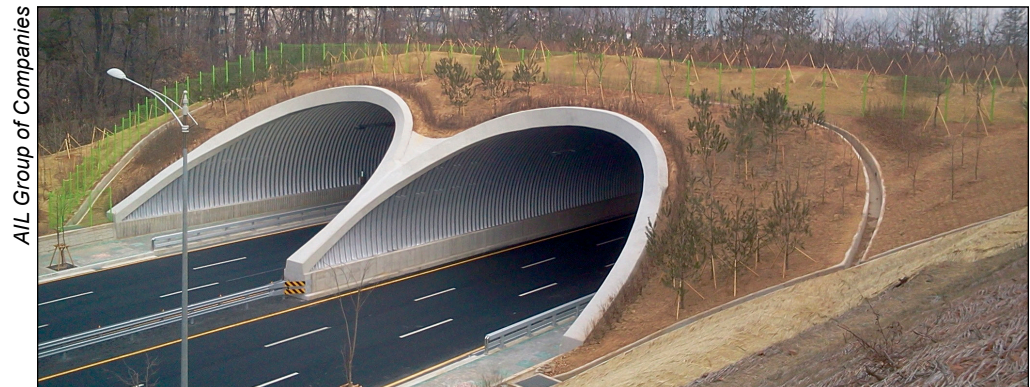
Figure 11—Bevel end treatment.

New materials, technologies, products, and methods developed for other applications should be routinely assessed to determine whether they apply or can be adapted to wildlife crossing structures. Two promising options for wildlife overpasses include geosynthetic reinforced soil buried bridges (fig. 12) and high-density expanded polystyrene geofoam blocks (fig. 13). Other new and emerging materials include ultra-high-performance fiber-reinforced concrete, resins, and laminates.