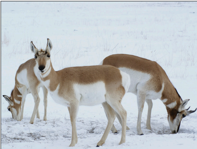
Figure 1—Pronghorn antelope, native to western North America, must move long distances to meet their needs for food and water over the seasons. Roads and fences hinder their ability to move freely to meet these needs.