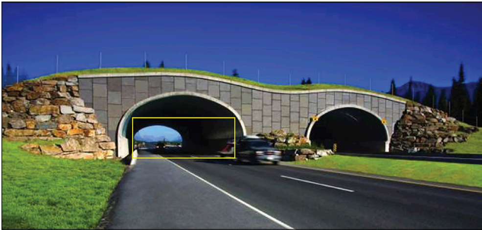
ALL Group of Companies