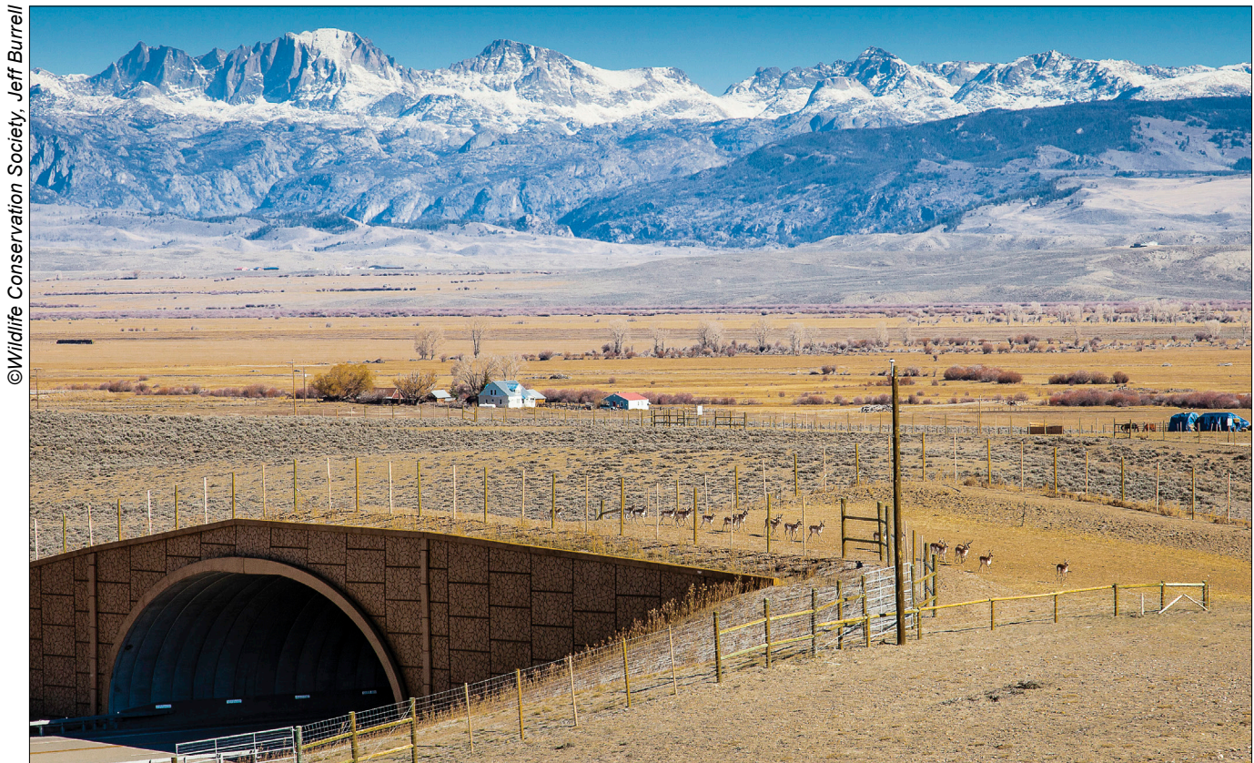
Figure 3—Pronghorn antelope using Trapper's Point wildlife overpass across U.S. Hwy 191, near Pinedale, Wyoming. This overpass was placed at a migration route for pronghorns, enabling it to be used by migrating pronghorn within days of its completion.

When planning how to mitigate the disruptive effects of a road on wildlife, decisions are often made with little consideration for larger temporal or spatial scale consequences. The project's vision and goals may be limited to current wildlife populations, or to fine-scale conditions in the immediate vicinity of the crossing structure. Wildlife overpasses designed to have a lifespan of 70-or-more years should consider the changing needs of targeted wildlife populations. Over the structure's lifespan, populations may grow, exhibit changing patterns of movement, appear for the first time, reappear after being absent from the local landscape, or change behavior owing to external stressors such as climate change. To be effective and hold conservation value, crossing structures must maintain or restore ecological connectivity for a wide variety of dynamic species populations over the long term (fig. 3). Context is critical when planning and designing wildlife crossing structures. Every mitigation plan will be different. For instance, mitigation needs and planning will be vastly different between mountain and coastal terrain and vary depending on