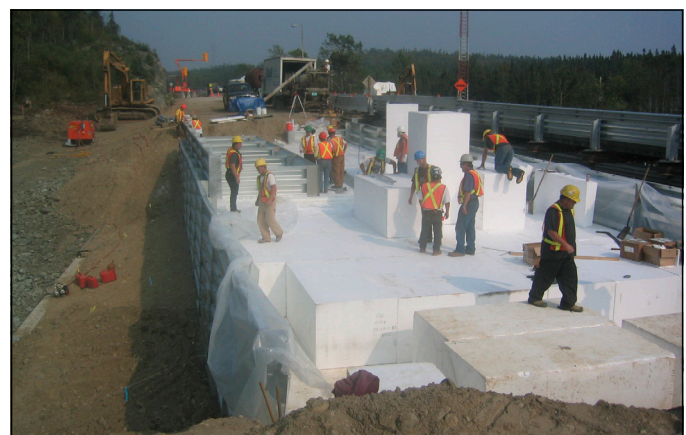
Figure 13—Expanded polystyrene geofoam embankment fill along I-15, Salt Lake City, Utah. Geofoam Research Center, Syracuse University.