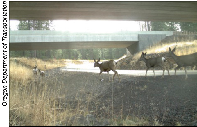
Figure 9—Mule deer walk through an underpass with an access road to Lava Lands Visitor Center on the Deschutes National Forest in Oregon. The twin underpasses under busy U.S. 97 serve animals at night and in the off seasons when the visitor center is closed.