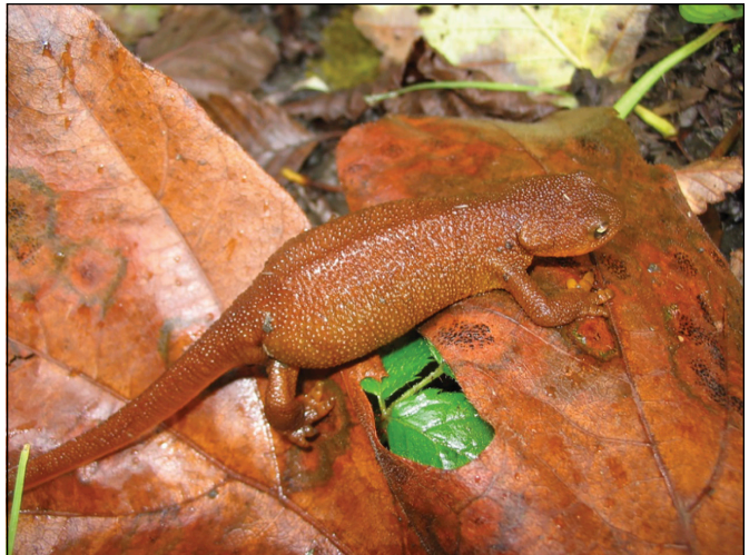
Figure 2—Unlike the wide-ranging pronghorn, this rough-skinned newt moves relatively short distances in its search for food and mates. However, it must have precise habitat conditions otherwise it will dry out and perish.