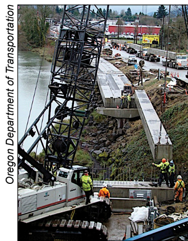
Figure 8—Crews place large concrete box beams for the new path viaduct near the Willamette River in Oregon.

Other examples include the use of alternative materials, such as recycled or reused asphalt pavement mixtures, as backfill where traditional materials are lacking or in short supply. Identifying backfill materials from adjacent construction early on during planning and design can result in cost savings where cut-and-fill materials are redistributed across several regional project locations nearby.