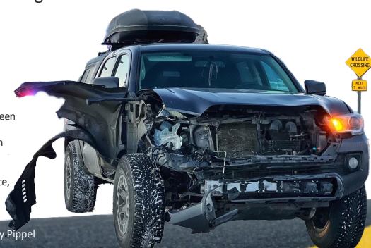
Photo of vehicle

Get more information and view the full report: